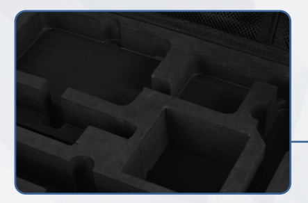
The internal anti-collision design uses high-density sponge to isolate and protect tools.

Plastic handle, Ergonomic design arc, keep your hands comfortable.