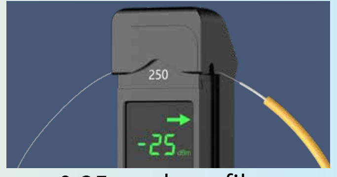
0.25mm bare fibers